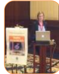
Mary Herbert Institute for Ageing and Health, UK