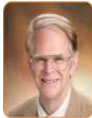
Douglas Wallace Center of Mitochondrial and Epigenomic Medicine, USA